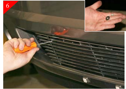
6 Attach the billet grille using the supplied Nyloc nut and washer.