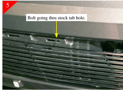
5 Now place billet grille into opening and center. There are slots in the bumper opening where the tabs on the black plastic bumper cover attached. This is where the bolts go thru. (Ref step 3).