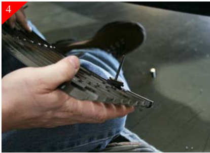
4 Place the supplied bolts thru the mounting tabs on the billet grille. Then place only on the bottom bolts (2) supplied square spacers on the backside as shown above.