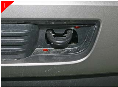
Locate the (2) plastic rivets in the tow hook area shown above in RED.