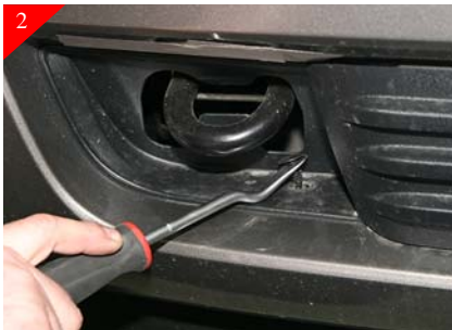
Then using a regular screwdriver or pry tool remove the rivets as shown above and repeat for the other side.