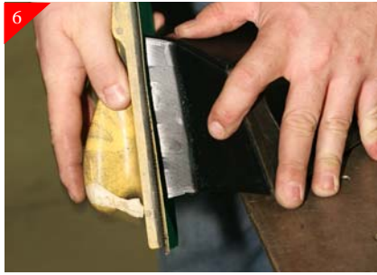
Using a sanding block sand the just cut areas.