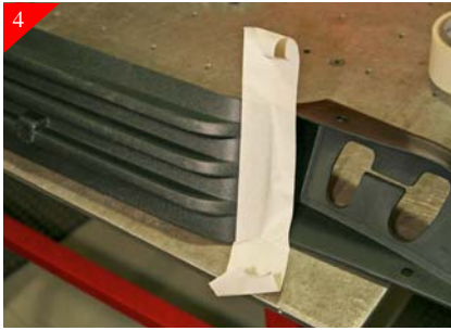
Located on the plastic bumper cover that was just removed. There are 3 horizontal plastic ribs that taper off and blend in. Place a piece of masking at this point or as shown above. This is just to give you a guide or cut line.