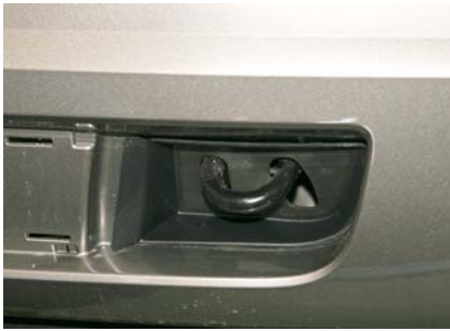
Place the plastic tow hook covers back in place and secure using the stock plastic rivets (Ref. step1).