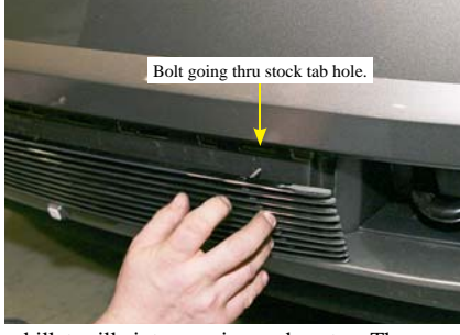
Now place billet grille into opening and center. There are slots in the bumper opening where the tabs on the black plastic bumper cover attached. This is where the bolts go thru. (Ref step 3).