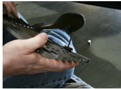
Place the supplied bolts thru the mounting tabs on the billet grille. Then place only on the bottom bolts (2) supplied square spacers on the backside as shown above.