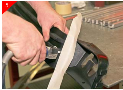
Using a hack saw or power/air saw to cut the plastic following the tape line as shown above. You will only need to keep the (2) outer pockets that go in the tow hook area.