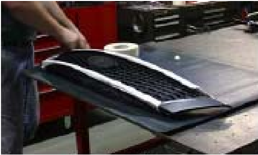
Next tape stock grille shell using masking tape to protect during install.