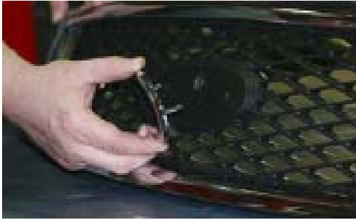
Remove Stock "Blue Oval" emblem.