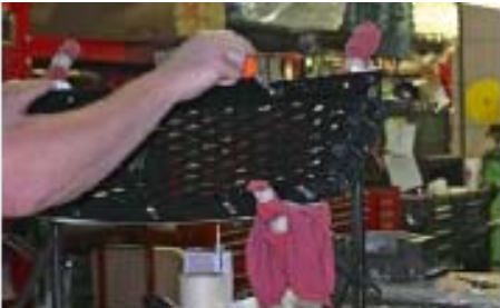
Remove the (6) Torx (T-20) along top of grille shell as shown. After screws are removed top portion will be free.

Keep this portion of grille shell you will be needing it to reinstall grille.