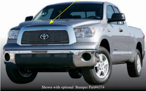
Shown with optional Bumper Part#4374