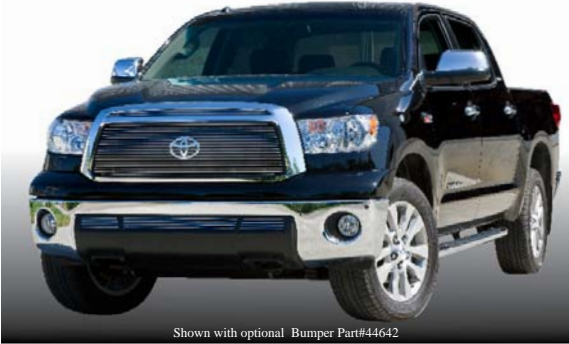
Shown with optional Bumper Part#44642

Shown with Upper Main Grille Part#44622 & 4463 Machined Hood Insert