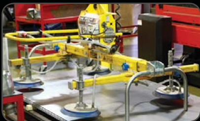
TABLE SIZE & Material Handling Lift

Aluminium Alloys up to 3/8" (.375") in thickness