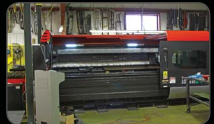
Table Size 60" x 120"

Call or email for a quotation on your parts today.