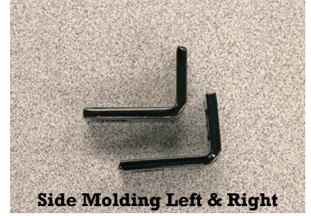
Side Molding Left & Right