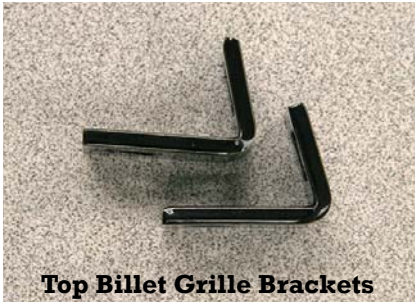
Top Billet Grille Brackets