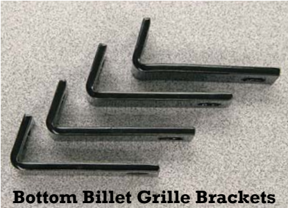
Bottom Billet Grille Brackets