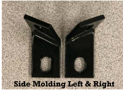
Side Molding Left & Right